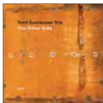
56 Tord Gustavsen Trio