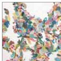
62 Big Heart Machine