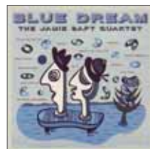
69 The Jamie Saft Quartet